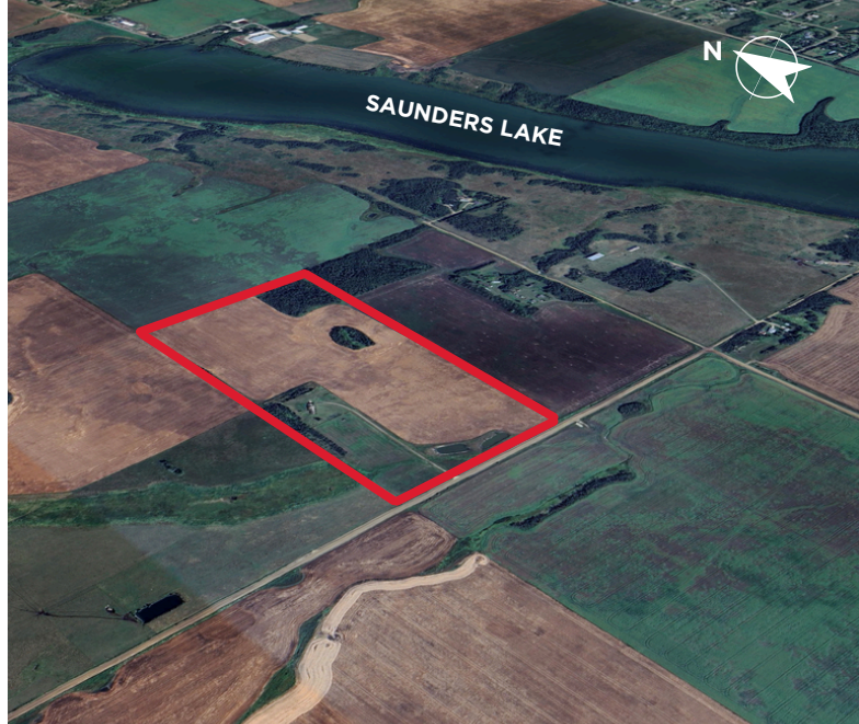
Property looking Northwest